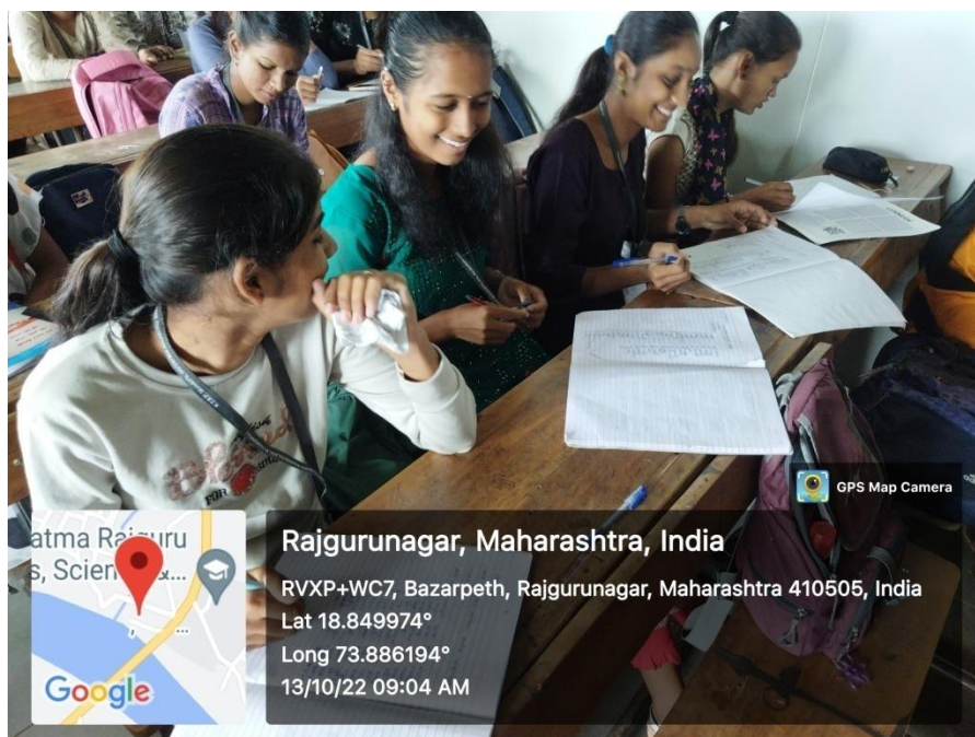
Photo 1. Students writing Names of trees