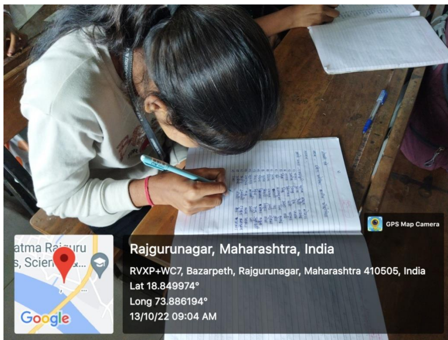
Photo No. 3. Girl writing names of trees.