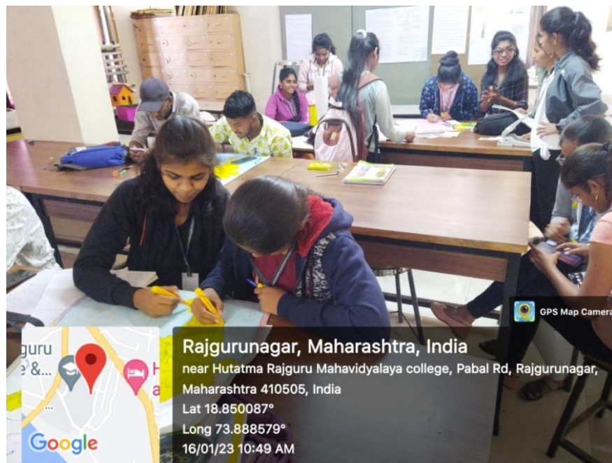
Students involving in Map Making activity