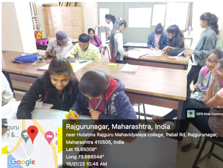
Students involving in map making