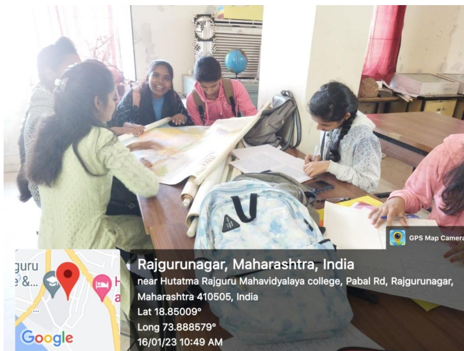
Students involving in Map Making activity