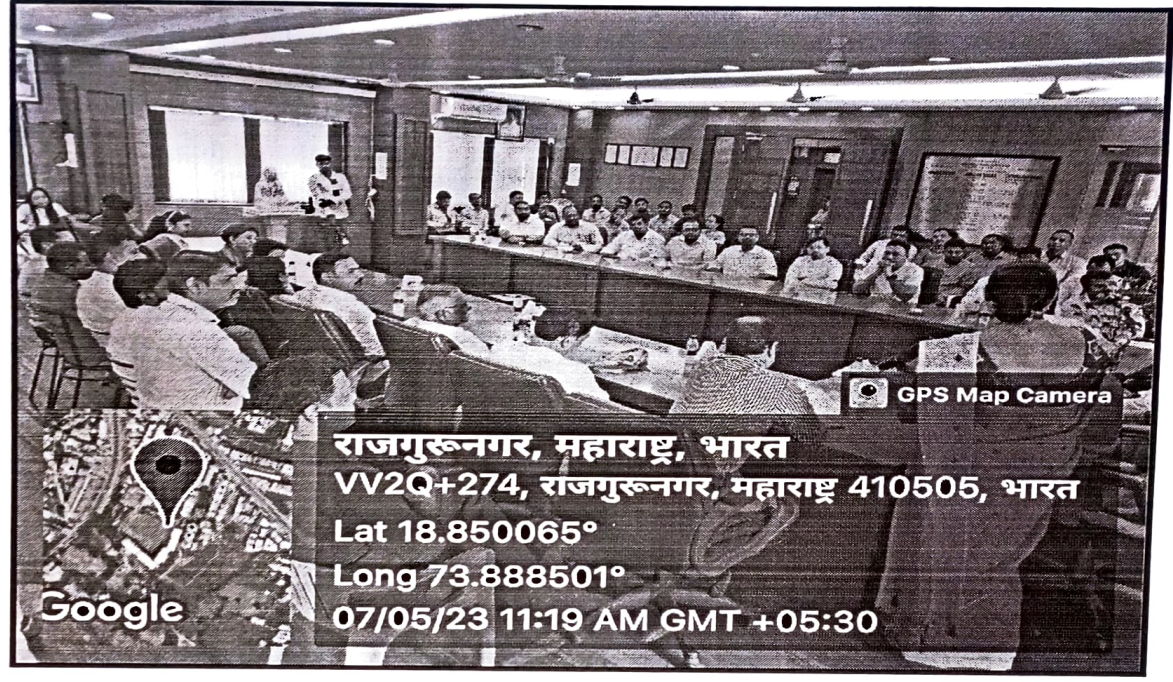
Alumni Meet - 2005 B.Com Batch