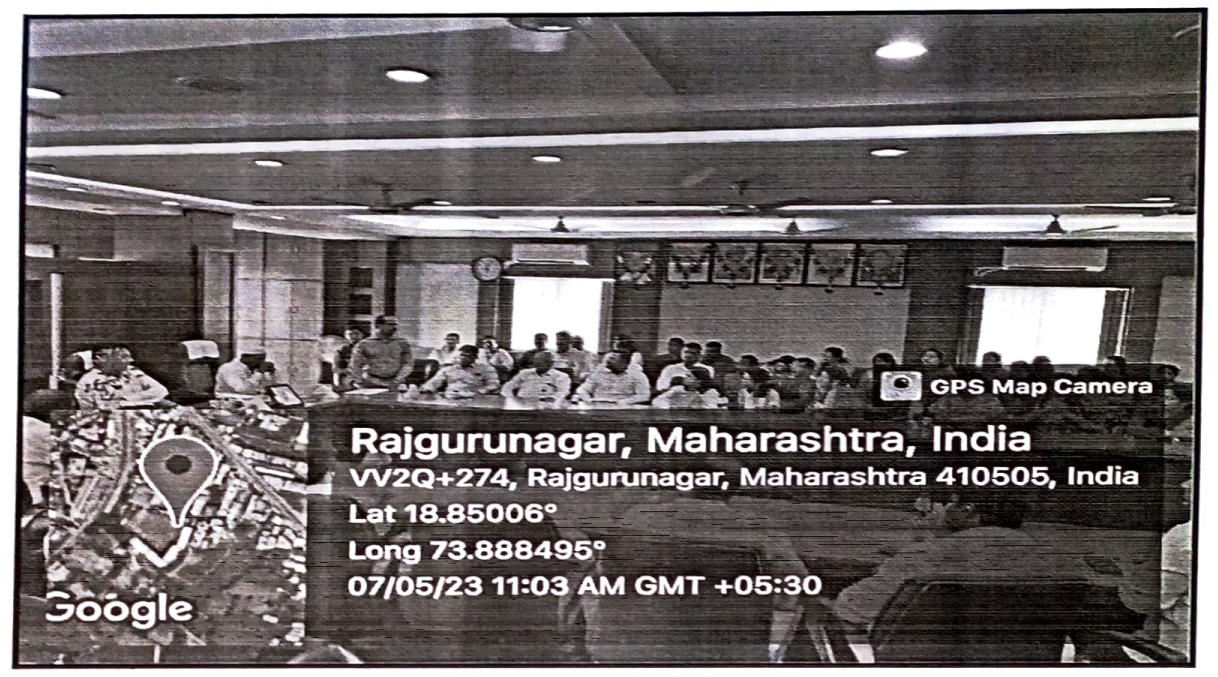
Alumni Meet - 2005 B.Com Batch