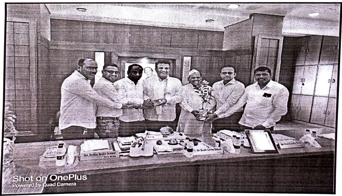
Alumni Meet - 2005 B.Com Batch 'Felicitation'