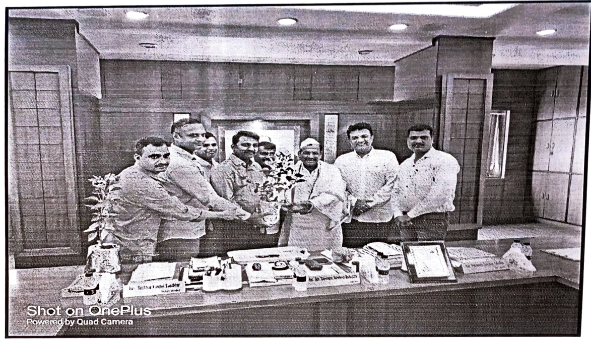
Alumni Meet - 2005 B.Com Batch 'Felicitation'