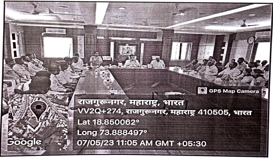
Alumni Meet - 2005 B.Com Batch