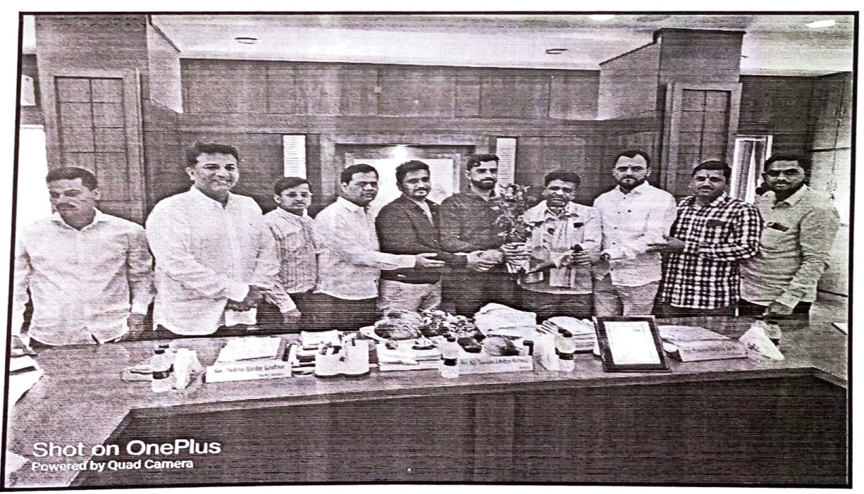
Alumni Meet - 2005 B.Com Batch 'Felicitation'