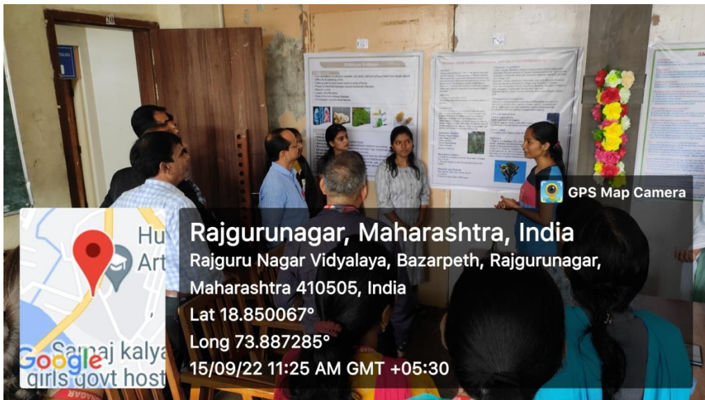
T.Y. B.Sc. Students presenting their project