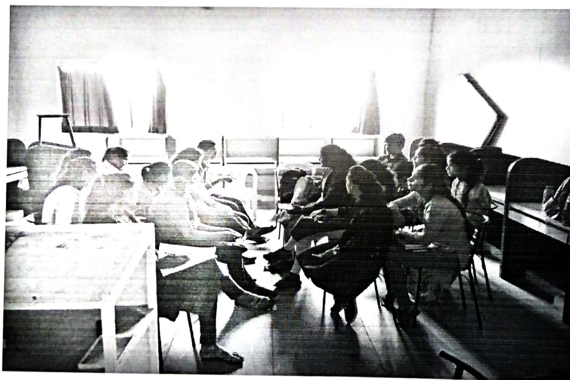
The students having discussion in the group