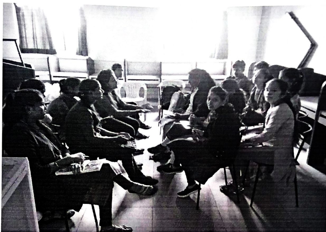
The concluding snapshots of the competition