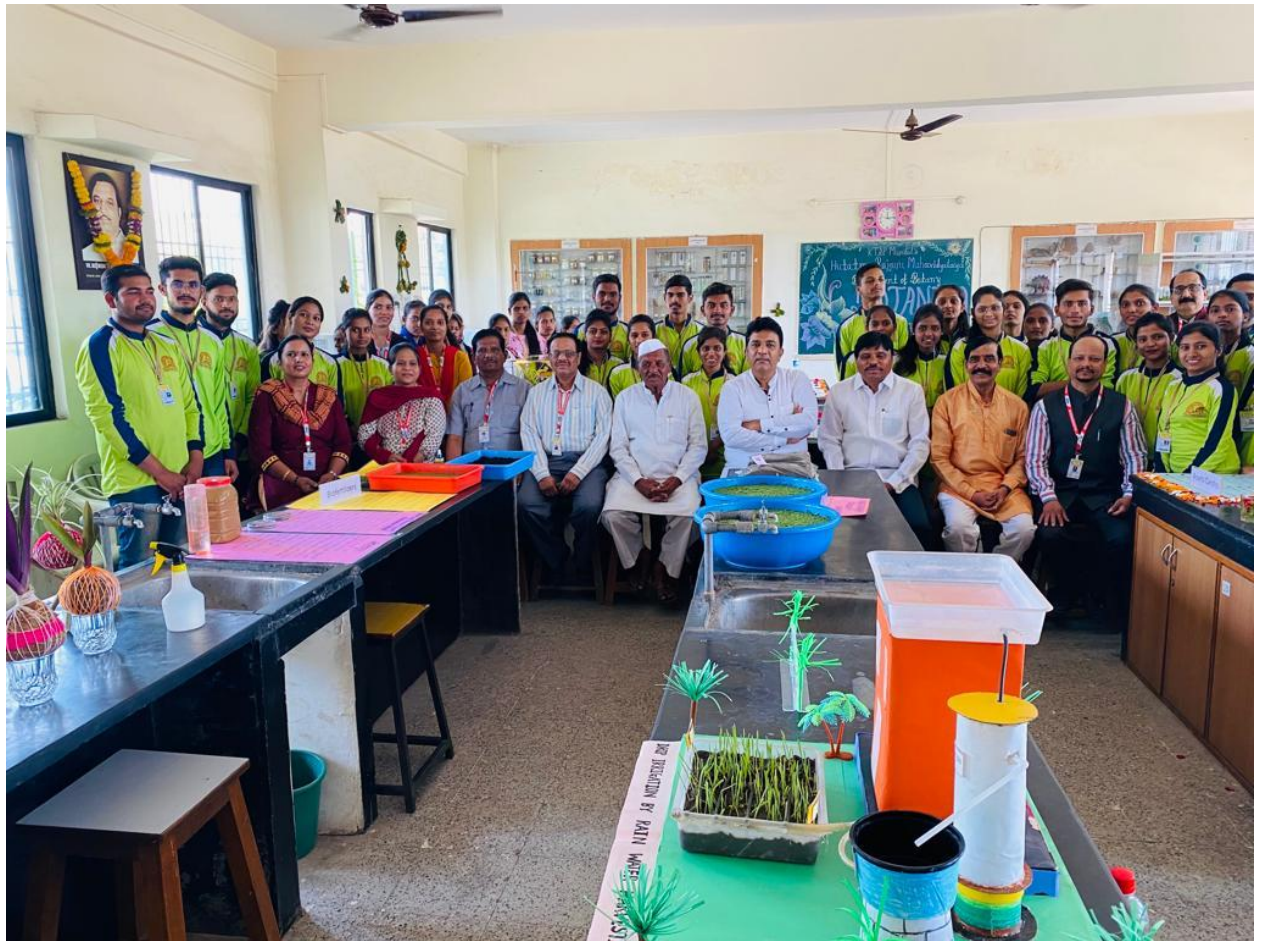
The whole team of BOTANIKA-2022 with delegates