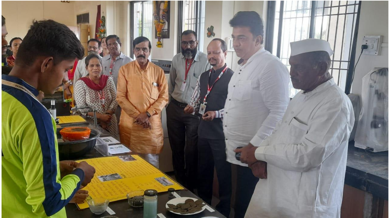
Honorable guests observing the project on Spirulina cultivation