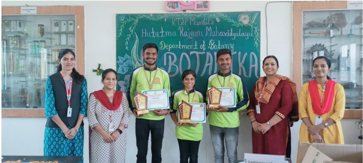
First prize winners with their mentors

Chairman enthusiastically observing the Spirulina culture under microscope