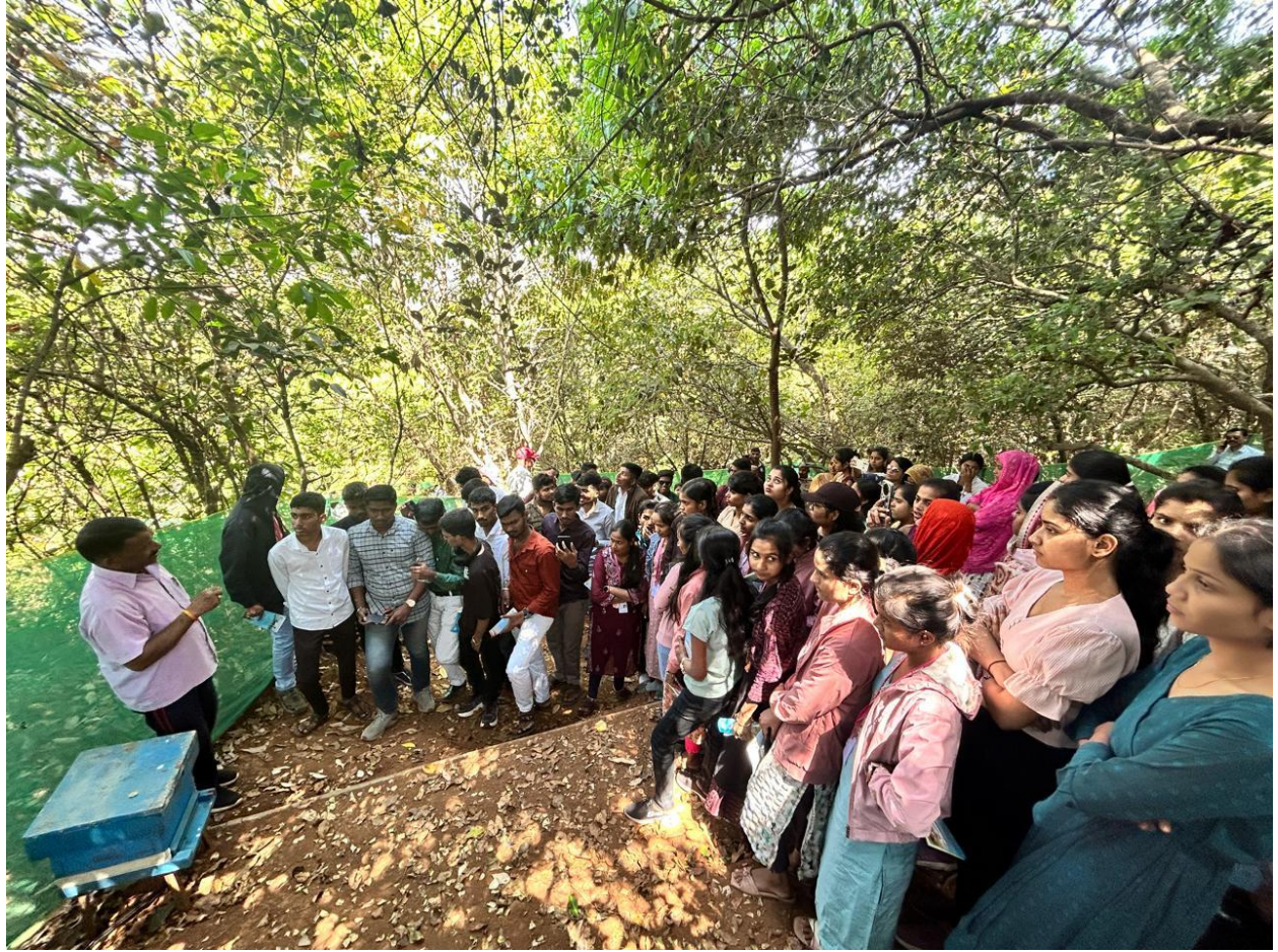
Photo 1:- Students taking the information about the Apiary Management at Manghar Village, Mahabaleshwar.