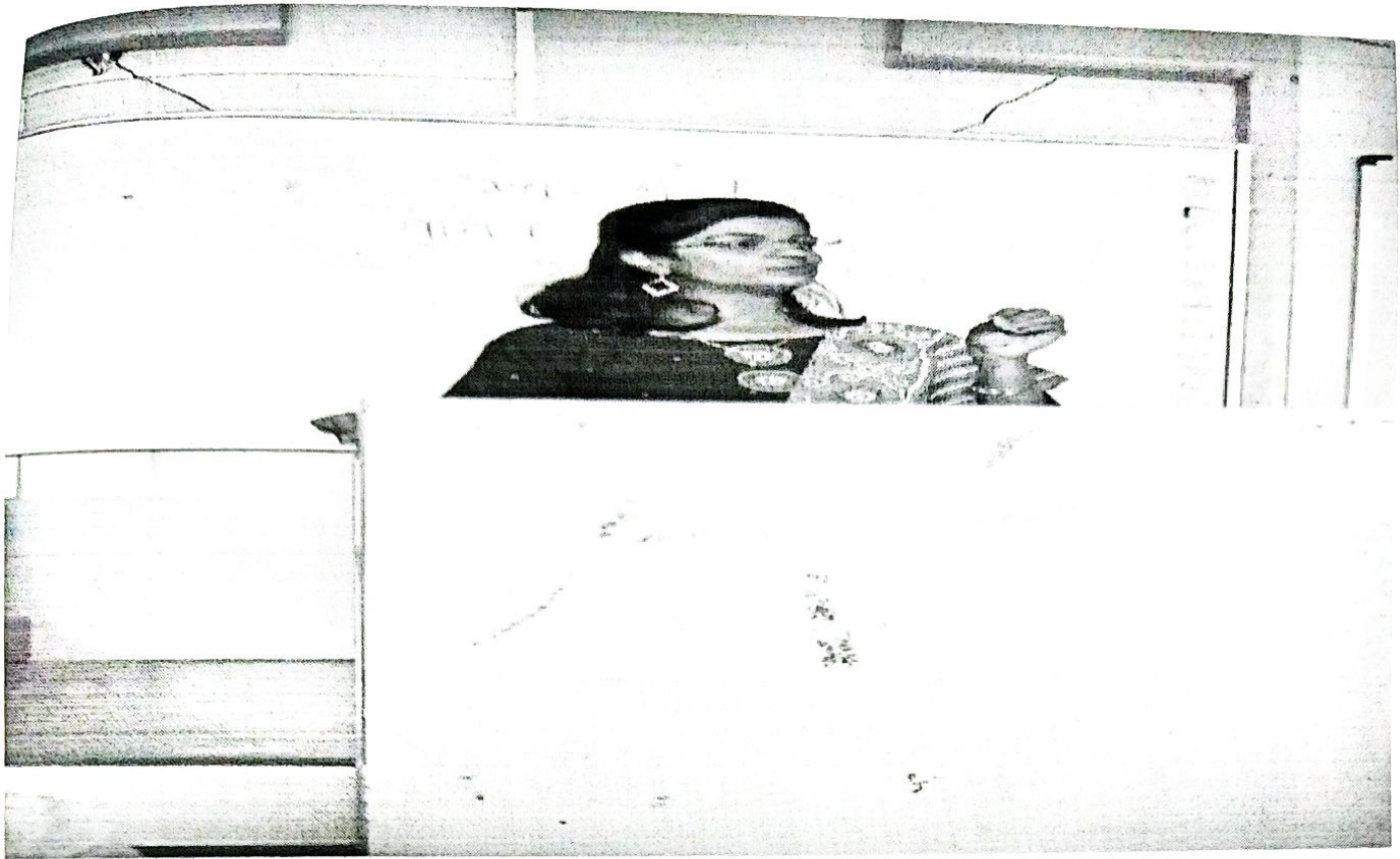
The resource person counseling the students