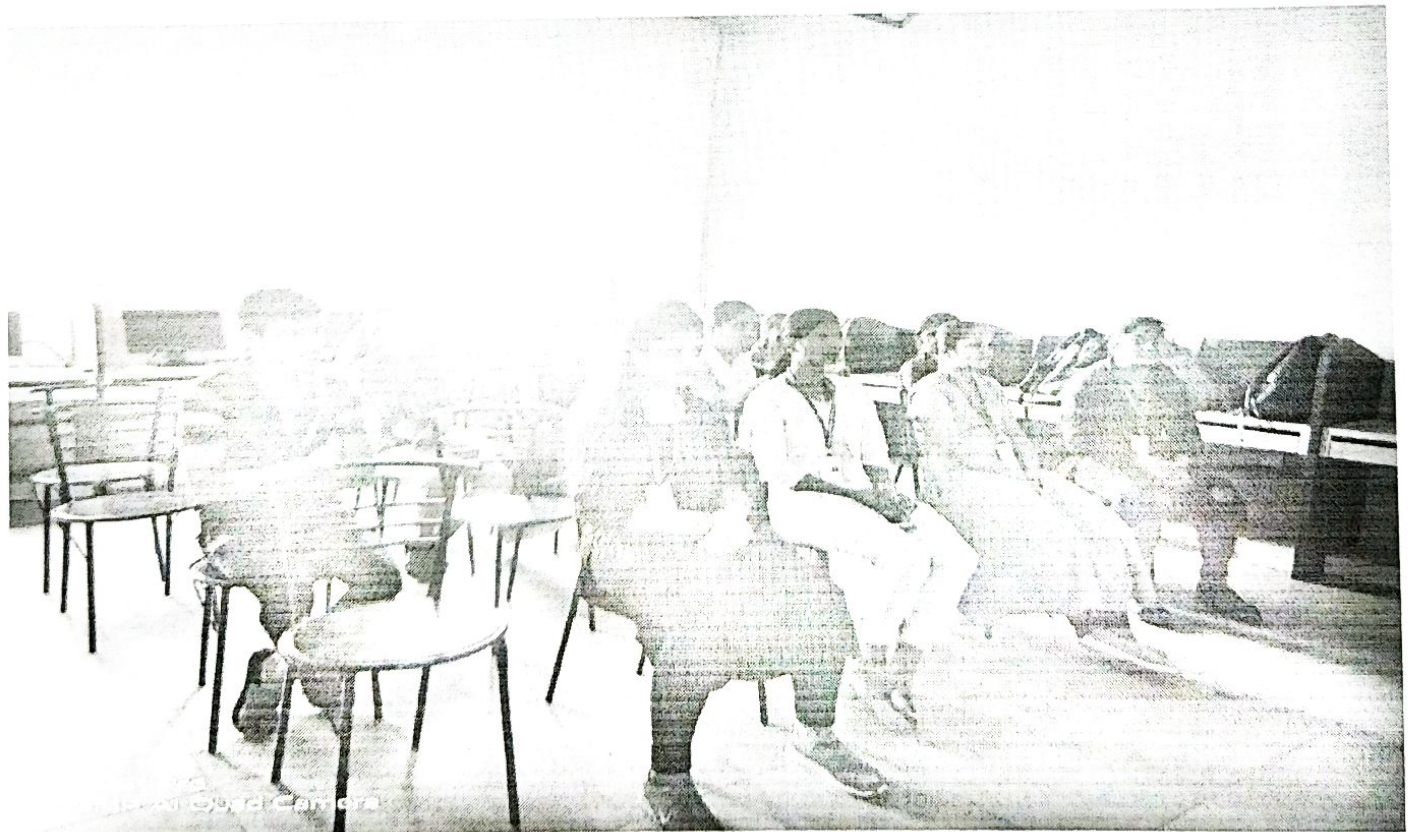
The students listening to the resource person