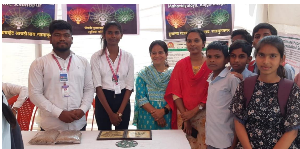
Group photo of Students with staff.