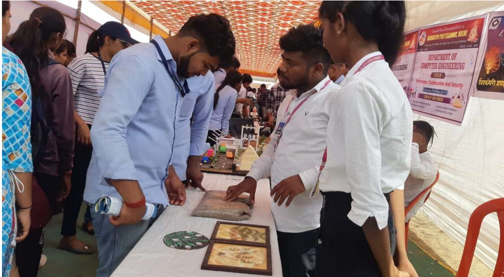
S.Y.B.Sc students explaining their project work to visitors.