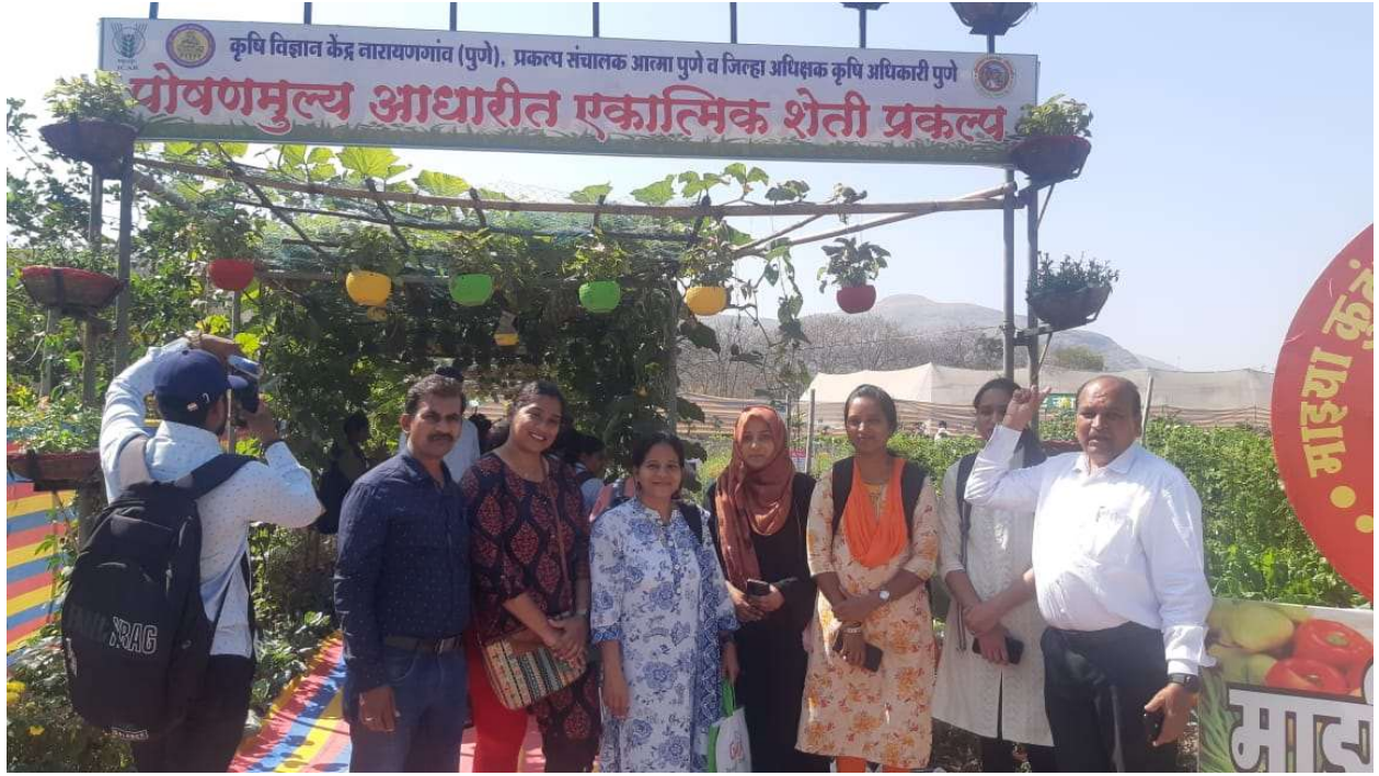
Staff of Manchar college & HRM college