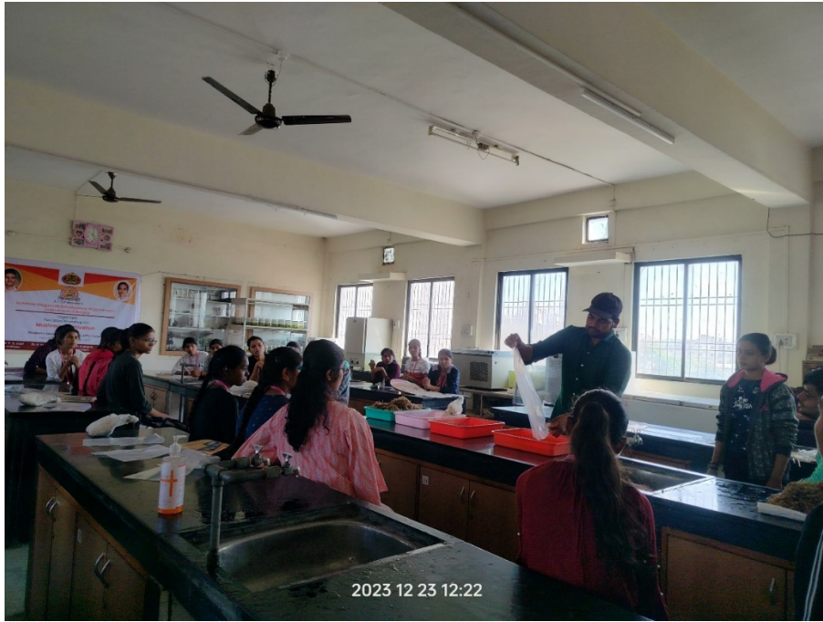
Alumni of Botany giving information about Mushroom cultivation.