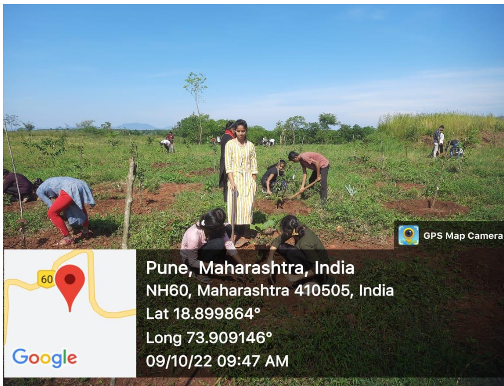
Student while doing plantation