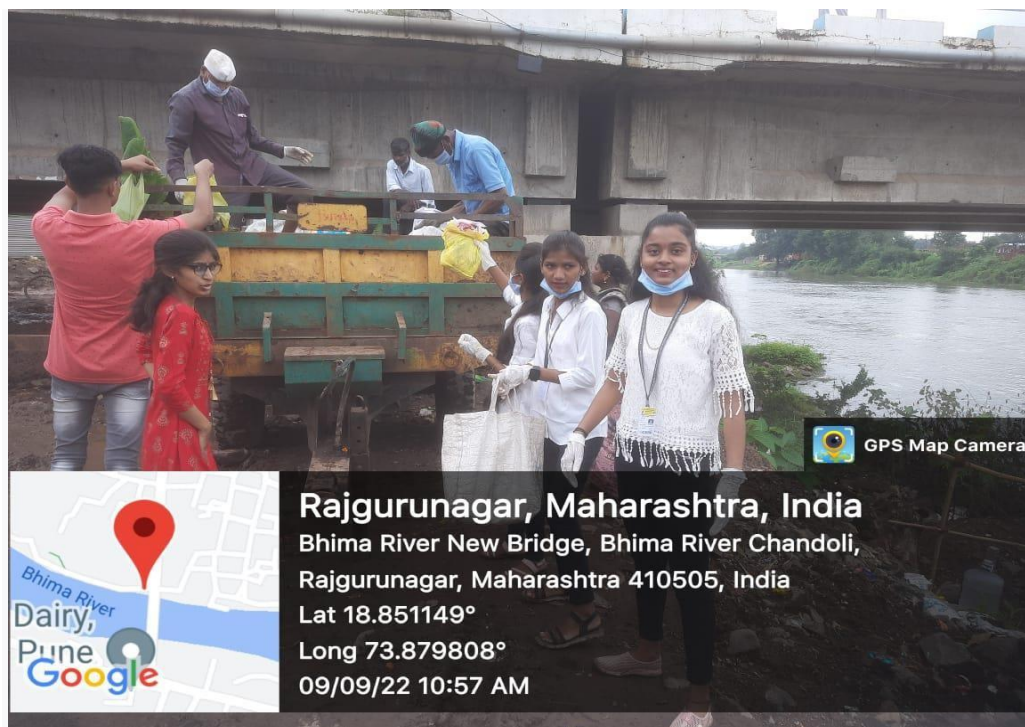
NSS Volunteers during the activity