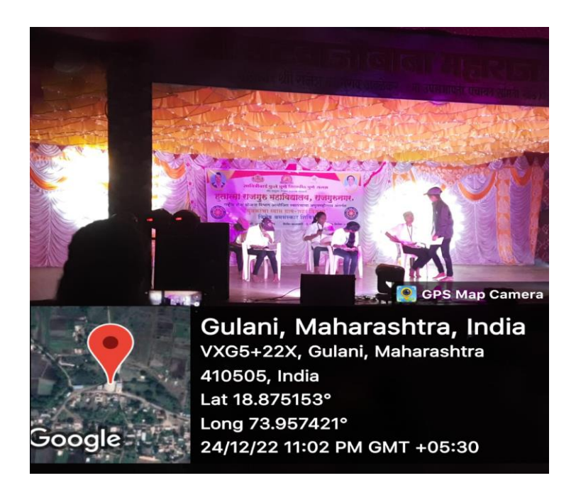
NSS volunteers performing in Cultural program in NSS camp