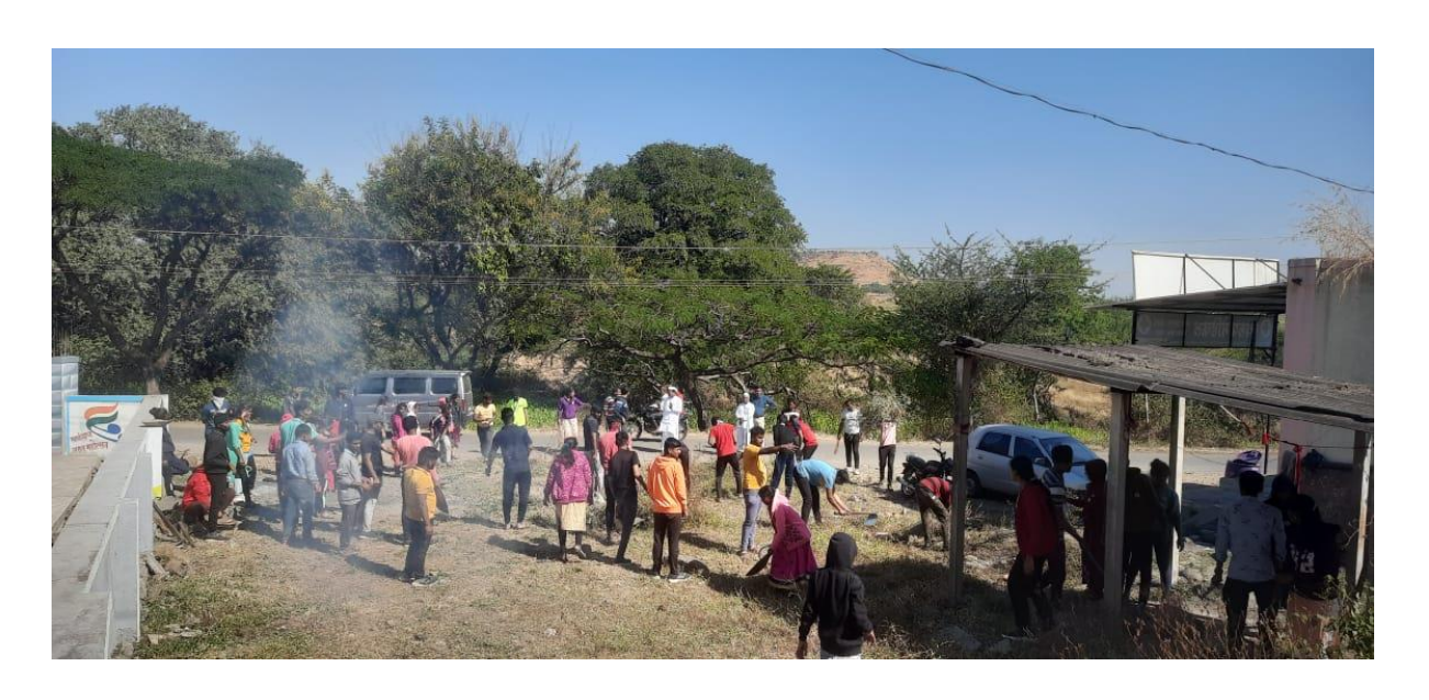
NSS volunteers while Cleaning village