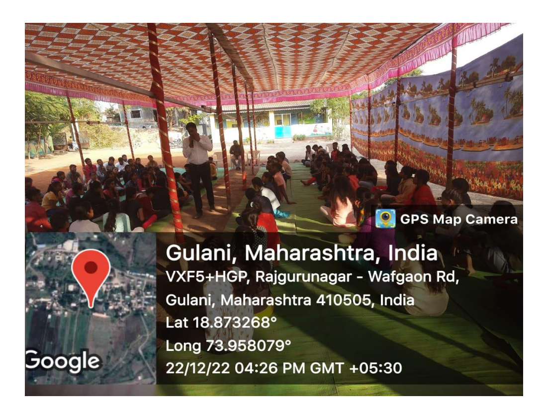
Students discussing with the guest