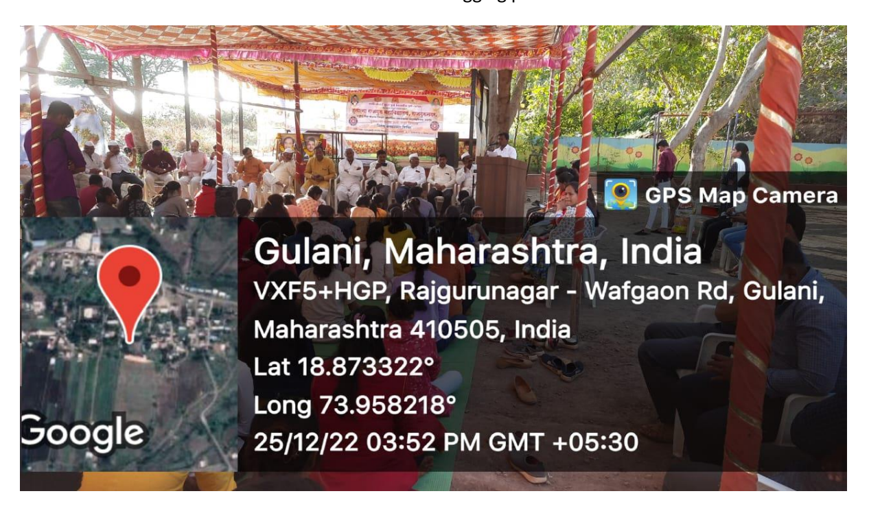
Last day of camp