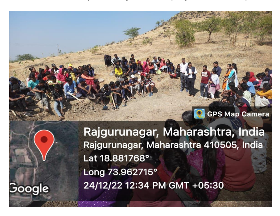
NSS volunteers while building small bandhara to restrict water