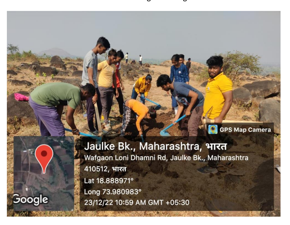
NSS volunteers making pits for tree plantation