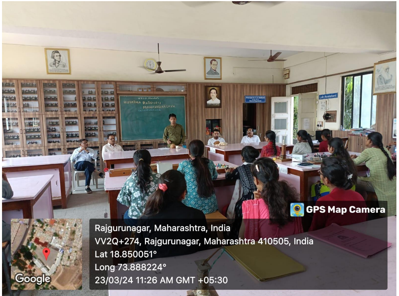
Photo 1. Lecture on Equal Opportunity Date: 23/03/ 2024, Strength: 47 EOC, Hutatma Rajguru Mahavidyalaya