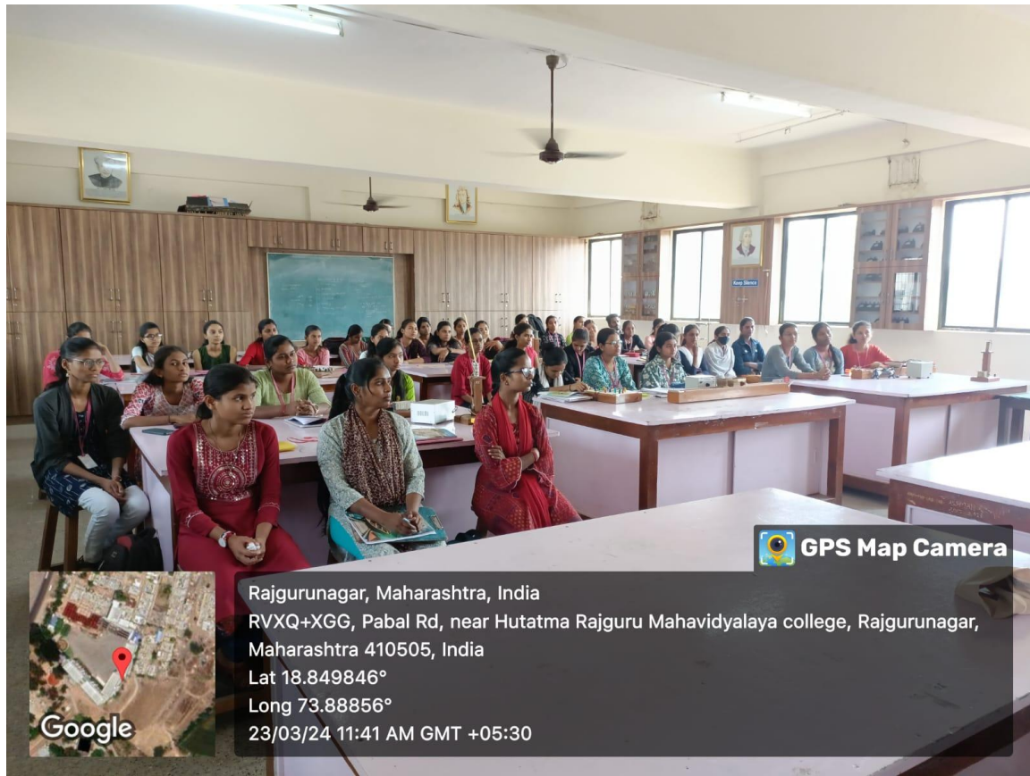
Photo 3. Lecture on Equal Opportunity Date: 23/03/ 2024, Strength: 47 EOC, Hutatma Rajguru Mahavidyalaya