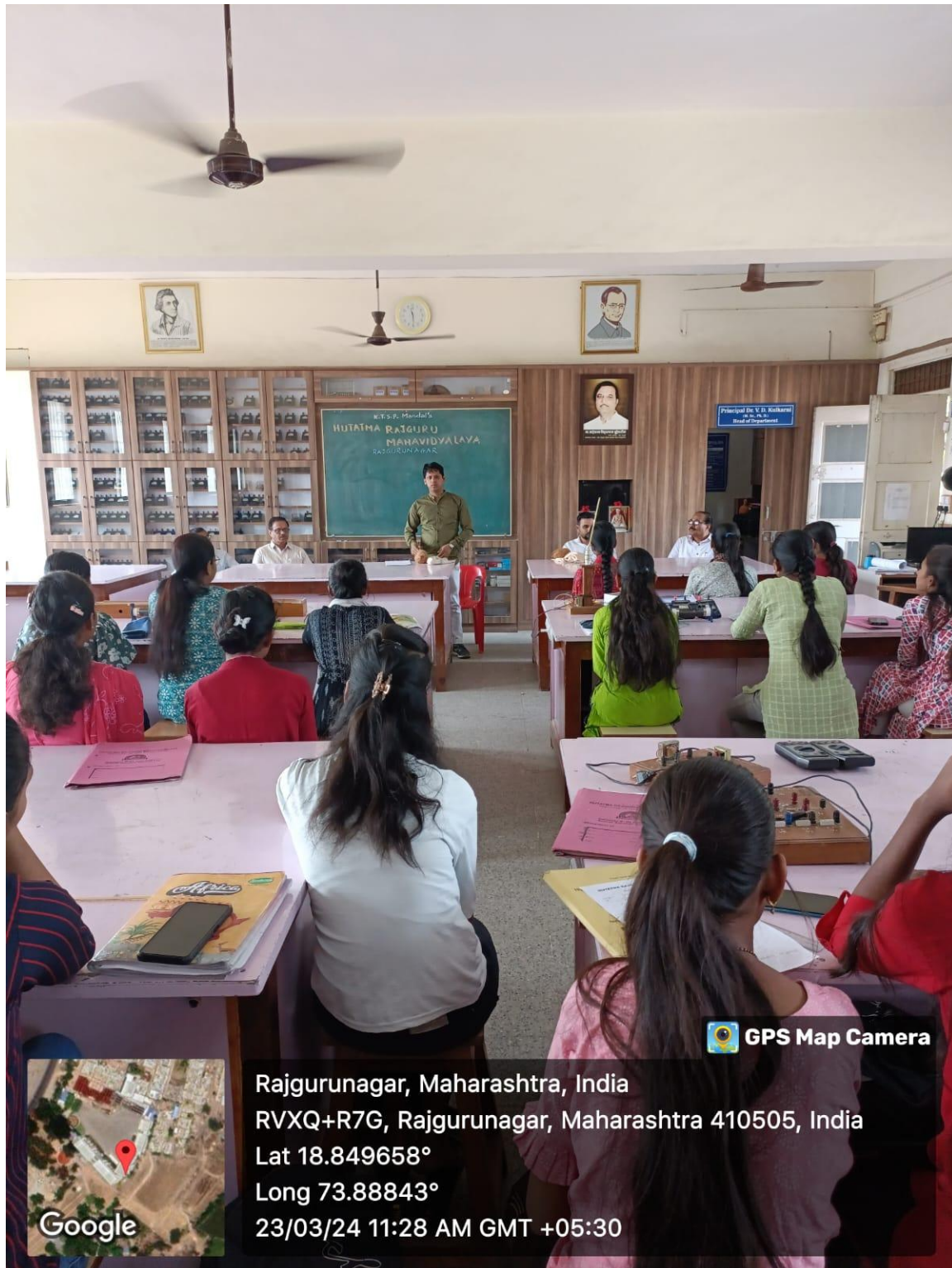
Photo 2. Lecture on Equal Opportunity Date: 23/03/ 2024, Strength: 47 EOC, Hutatma Rajguru Mahavidyalaya