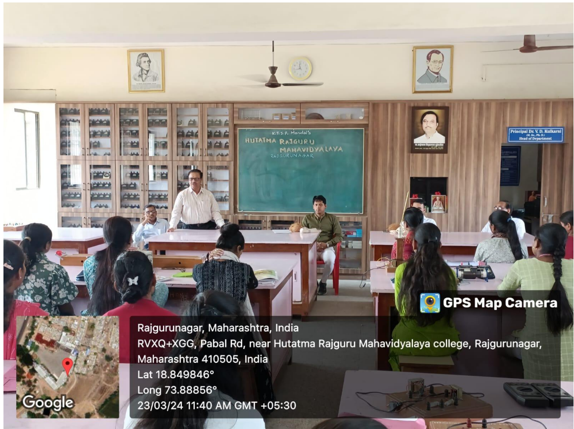
Photo 4. Lecture on Equal Opportunity Date: 23/03/ 2024, Strength: 47 EOC, Hutatma Rajguru Mahavidyalaya