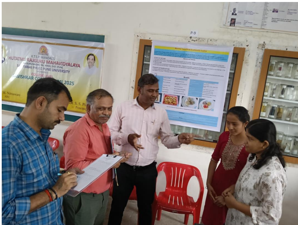
Judges while examining the posters