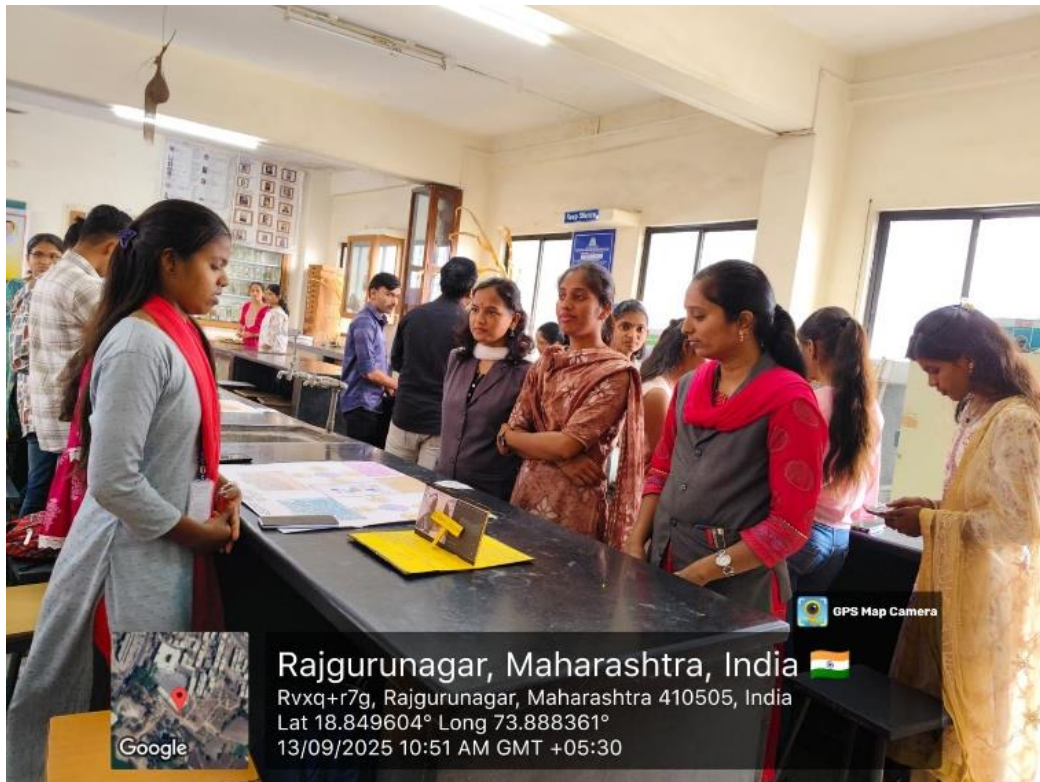
Staff asking the questions to the participants