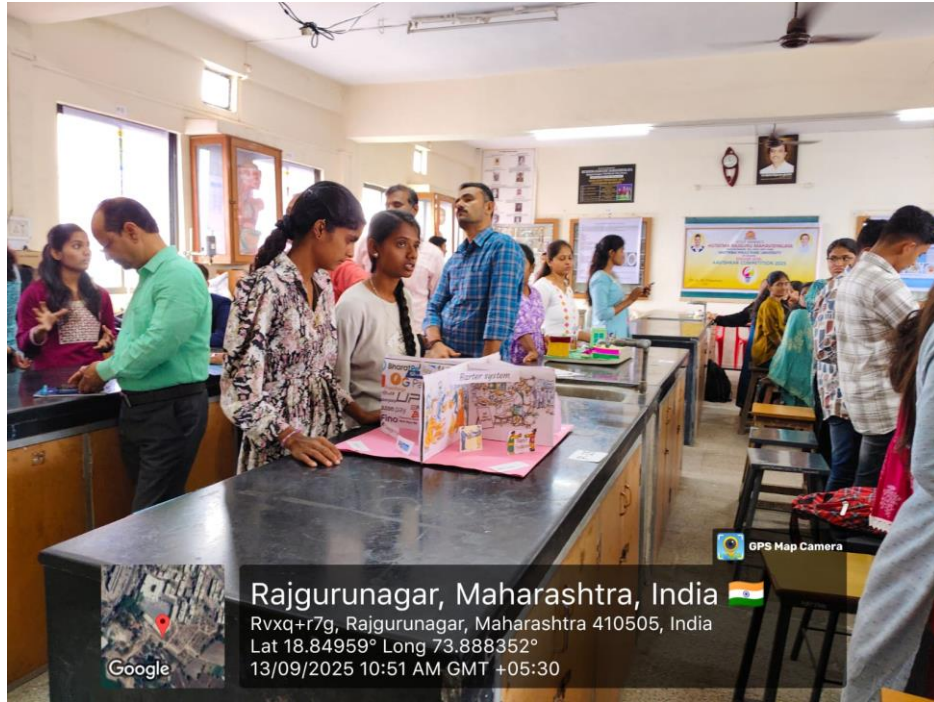
Participants of Aavishkar competition