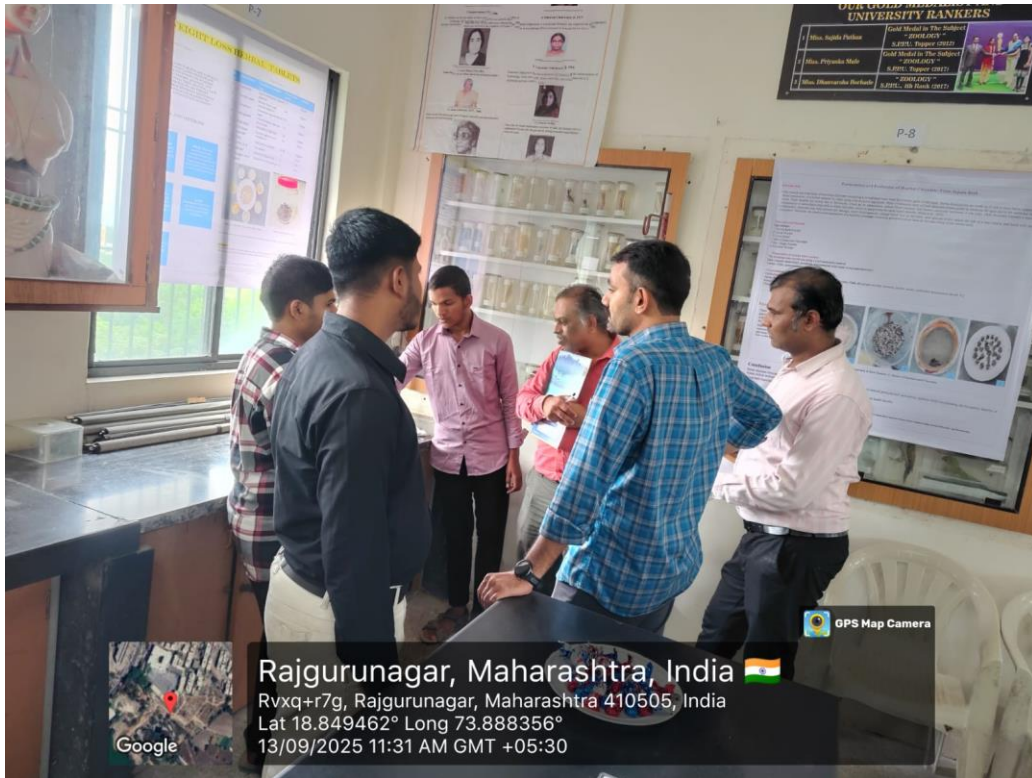
Project evaluation by the judges